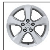
SLE V6 standard 17" aluminum alloy wheel