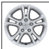
SE standard 16" aluminum alloy wheel

0 = Feature available only as part of an option combination.