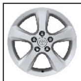
SE V6 available 17" aluminum alloy wheel